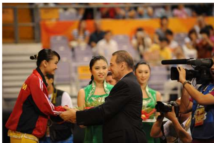
Dr. Jacques Rogge, IOC President, presents awards to the winners in the Wushu Tournament Beijing 2008